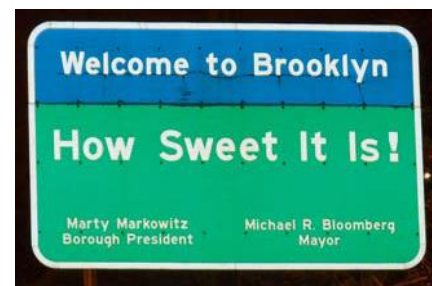
Photo 4: Brooklyn, NYC sign, site of national workshop, April, 2011

As an integral part the fellowship, the Environmental Public Health Tracking 2011 Workshop held in Brooklyn, New York City, NY on April 25 – 28 was attended. This annual meeting of the CDC's tracking state grantees was definitely a valuable component of the fellowship. Since the meeting was held near the Brooklyn Bridge, the workshop theme was appropriately titled, Bridging the Gap , which is where the tracking program is in some states that are trying to put all their pieces together to get networks up and running.